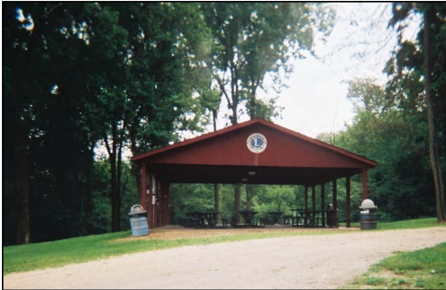
Lion's Club Shelter