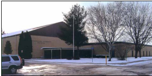
Southwestern High School