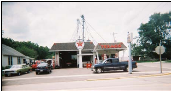
Symon's Auto Center